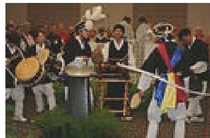
The Friday night opening worship service was led by members of the Messiah Korean Lutheran Church of Norcross.

Sign up for the E-News & Youth Ministry E-News